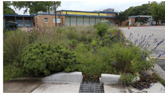
Rain garden in bloom at Reilly Elementary School