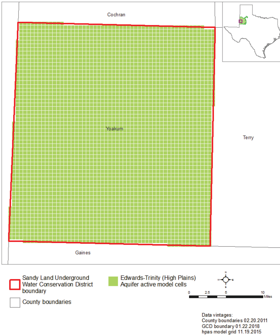
FIGURE 2. AREA OF THE GROUNDWATER AVAILABILITY MODEL FOR THE HIGH PLAINS AQUIFER SYSTEM FROM WHICH THE INFORMATION IN TABLE 2 WAS EXTRACTED (THE EDWARDS-TRINITY (HIGH PLAINS) AQUIFER EXTENT WITHIN THE DISTRICT BOUNDARY).