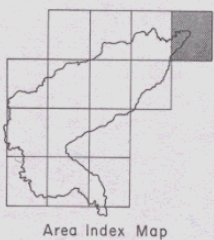
Area Index Map