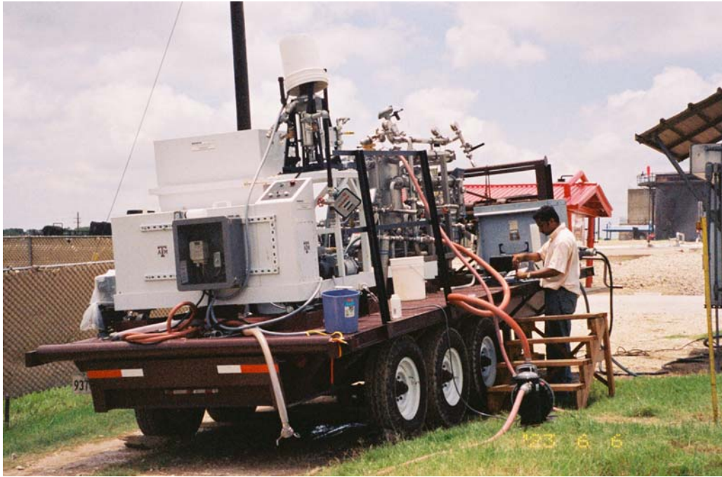
Figure 3. GPRI desalination trailer at the water treatment plant on the A&M campus.

Figure 3 illustrates the A&M desalination trailer during its trial run at the water treatment plant on the A&M campus in College Station. The unit is removing diesel and combustion byproducts from water at a waste treatment plant used for fire fighter training.