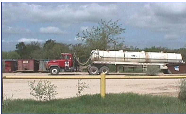
Figure 4 shows a 160 disposal well truck carrying oil field brine. A single SWD facility may receive as many as 80 trucks daily carrying brine from drilling, completion and production operations.